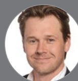
Niels Fuglsang MEP (S&D, DK)

“ The horrendous way in which we submit living animals to torturous journeys is a shameful example of one of the areas within animal welfare in the EU that is in need of fast improvement. The fight for an 8-hour transportation limit must continue. Animals are sentient beings and we should treat them as such. That is not the case today, and therefore we need to change the rules as soon as possible.”