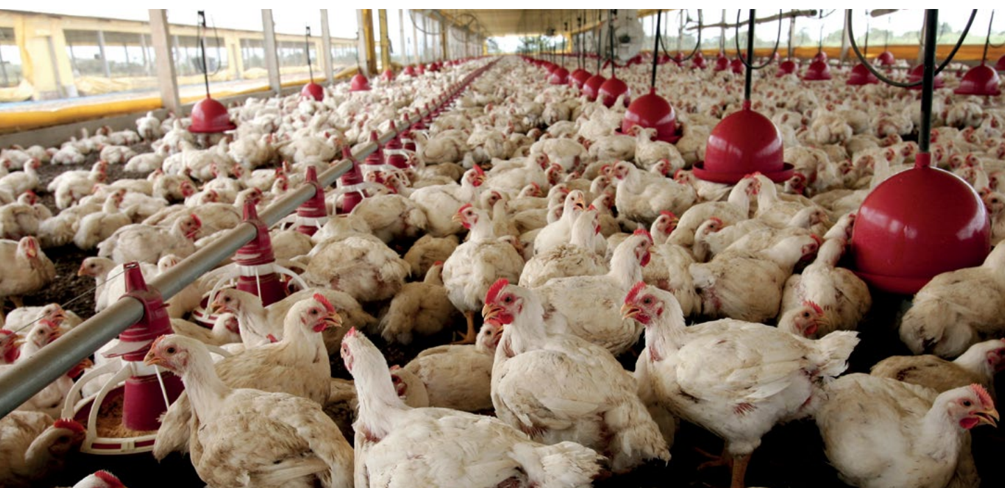
📷 Brazilian farm, with curtains open.