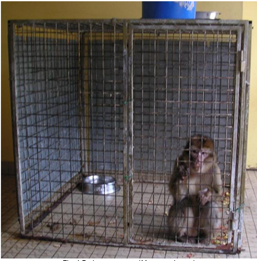
Fig. 1 Barbary macaque (Macaca sylvanus)

It is then clear that a comprehensive knowledge of the species and of their specialized housing requirements and environmental/ethological needs are unlikely to be held by the average keeper; this combined with the constraints of a household setting, makes extremely difficult to meet the Five Freedoms for many of the species of exotic pets.