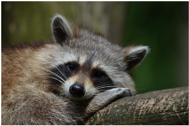
Fig.5 Raccoon (Procyon lotor)

Finally, the adoption of a positive list system doesn't imply an increased need for rescue centres: as with many cases of new legislation, also the positive list regulation might include transitional measures for owners of species not included on the list. This means that a higher influx of animals being brought to rescue centres immediately after adoption of the legislation can easily be avoided. For instance, the Belgian and the Dutch Positive List Regulations state that an animal which has been kept already or was in gestation at the moment when the Positive List came into force, can be kept and it can change owners (including commercially) until the moment of his natural death, as long as it is not allowed to breed . According to the Dutch Positive List, the animals must be identified and registered with the relevant authority, in order to ensure for a feasible and cost-effective enforcement.