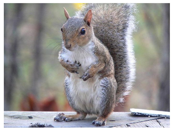
Fig.3 Grey squirrel (Sciurus carolinensis)

The invasive potential of a species in a particular country is not always known, as the behavior of a species may vary according to different environmental and ecological conditions (Faraone et al, 2008). Invasive species can have a number of negative impacts on the areas that they invade. Some invaders can physically alter the habitat in addition to destruction (Worth, 2004), like the Coypu ( Myocastor coypus ). Other invasive species may not destroy habitat but can have an impact by killing large numbers of endemic species (Dorcas et al, 2012). Burmese pythons, for example, are top predators in the Everglades. As such, they have decimated local mammal and bird populations. There is also the risk for native species to be outcompeted for resources by invasive species (Genovesi et al, 2015). For example, Asian carp were introduced into the US and outcompeted native fish for food and space which lead to declines in the native fish populations (National Wildlife Federation, U.S).